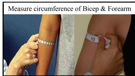
Measure circumference of Bicep & Forearm